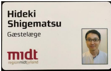
My name card