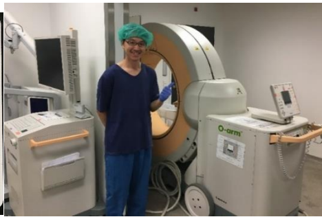
O-arm with me