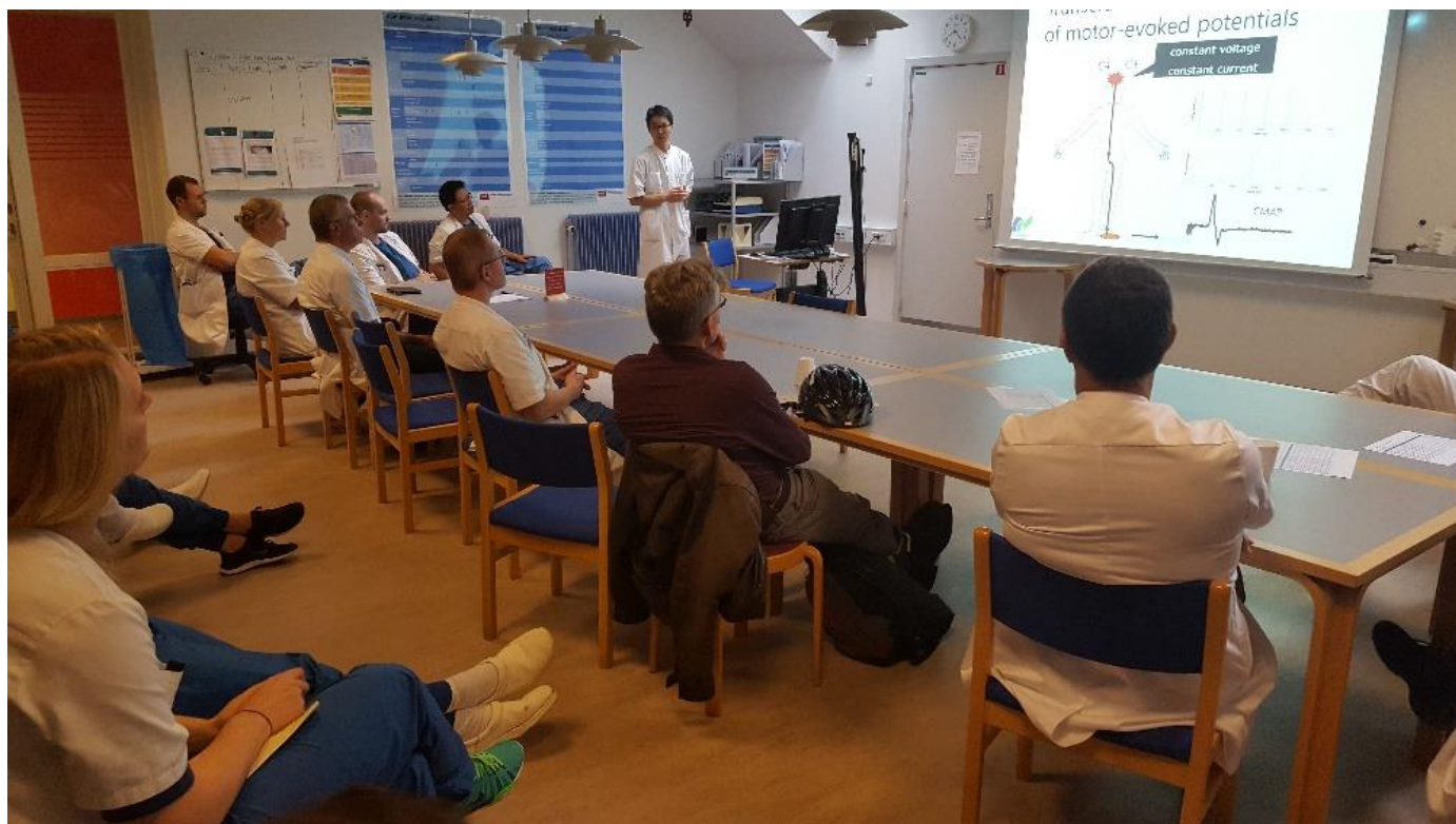
My presentation at morning conference

Every morning the conference start from 8 AM. There were also many case conferences where residents presented difficult cases and the senior members discussed the plan of management (Table 1). Here I was given opportunity to present my own research (Photo). Especially in spine case conference, it was great opportunity to learn about their theories.